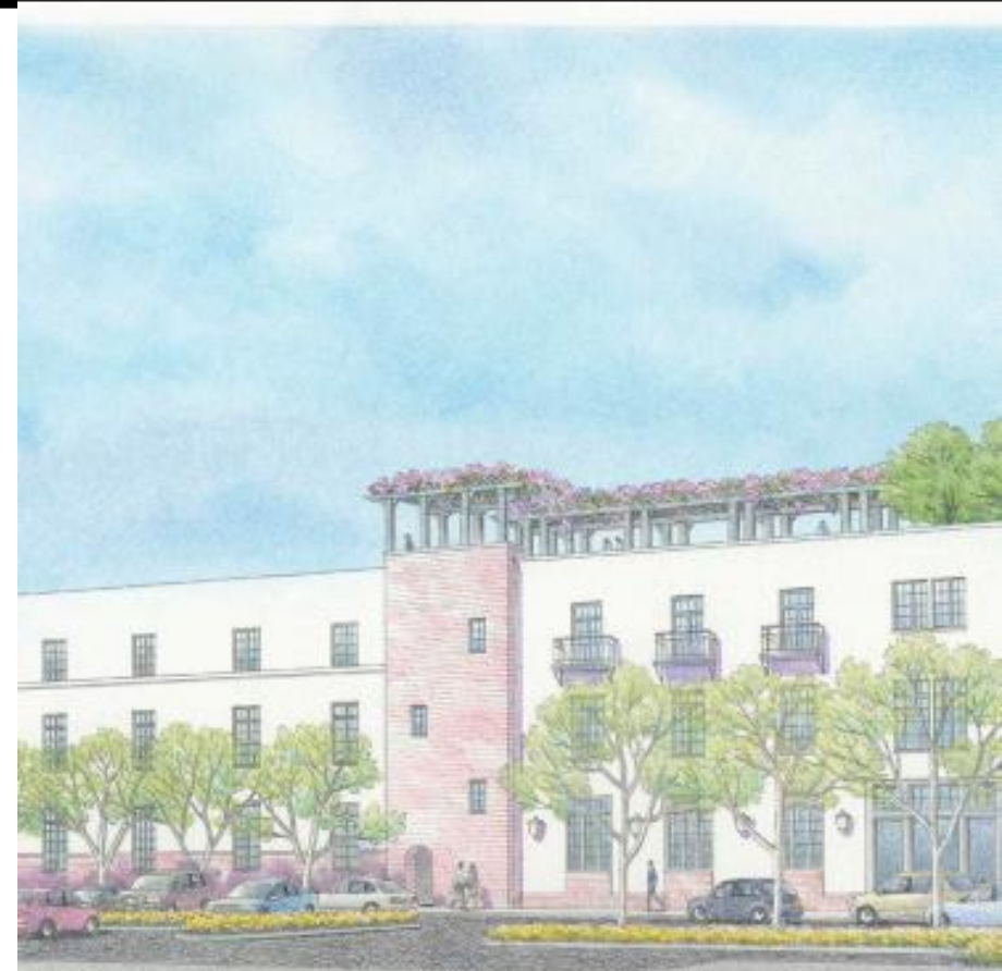
The Barlow Hotel