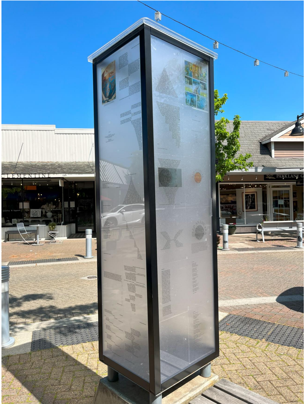
Dimensions: 14in. X 20in. X 5ft. Weight approx 20lb. to 30lb.