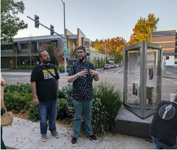
Bellevue Arts Commission Sculpture [Bellevue, Washington]