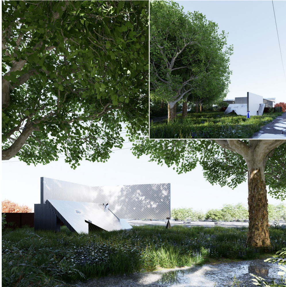
Schematic site perspective, as seen from Joe Rodota Trail, looking southwest Inset: Perspective, as seen from Petaluma Ave, looking south.

Like the famous Sebastopol apple trees, “NAME” is paradoxically both rooted in the terroir and released from it. Its panels seemingly levitate but are grounded in footings.