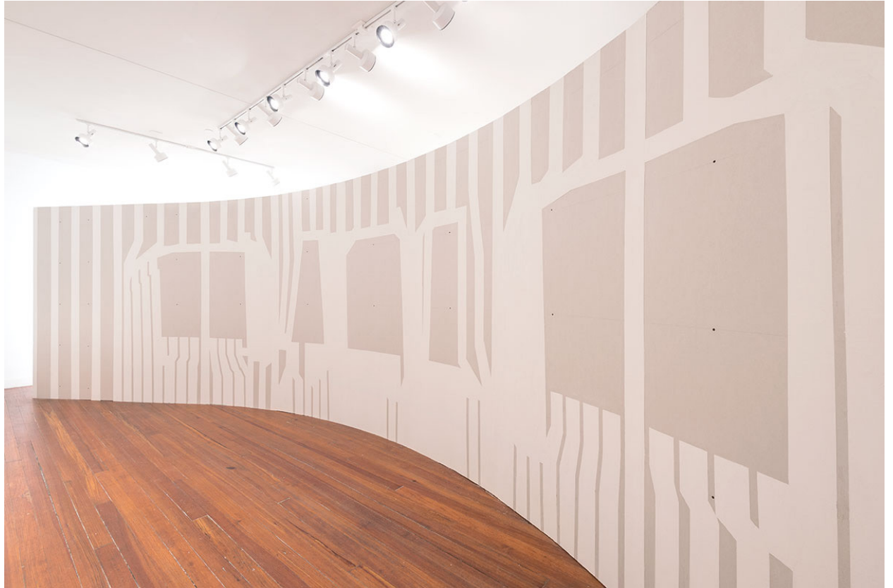
Michelle Chang, "Triptych," wood and plasterboard, 3' x 22' x 8', 2017, Houston, TX; Commissioned by Lawndale Art Center, $5,000