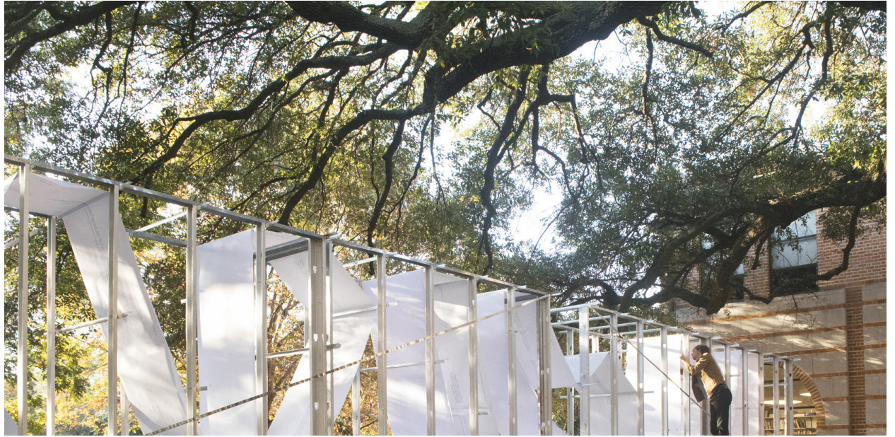
Michelle Chang, "A, B 1:2," wood and plasterboard, 42' x 12' x 5', 2018, Houston, TX; Commissioned by Rice Architecture, $5,000