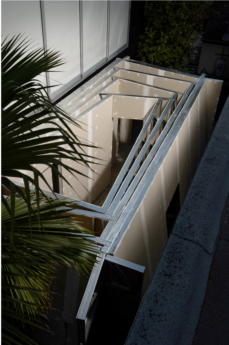
Michelle Chang, "Scoring, Building," metal and plasterboard, 8' x 24' x 10', 2022, Los Angeles, CA; Commissioned by Materials & Applications, $35,000 including programming