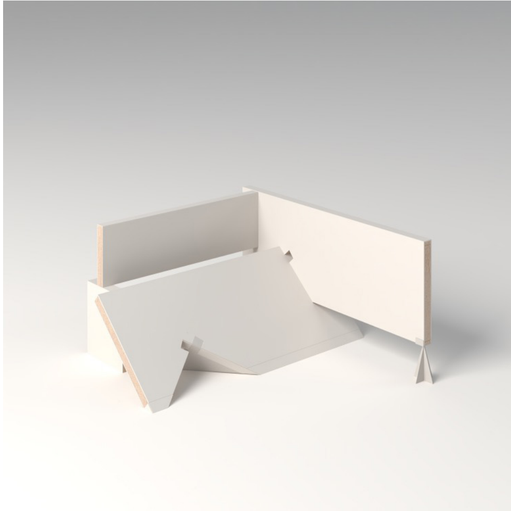
Paper model image showing wood framing beneath exterior sheathing