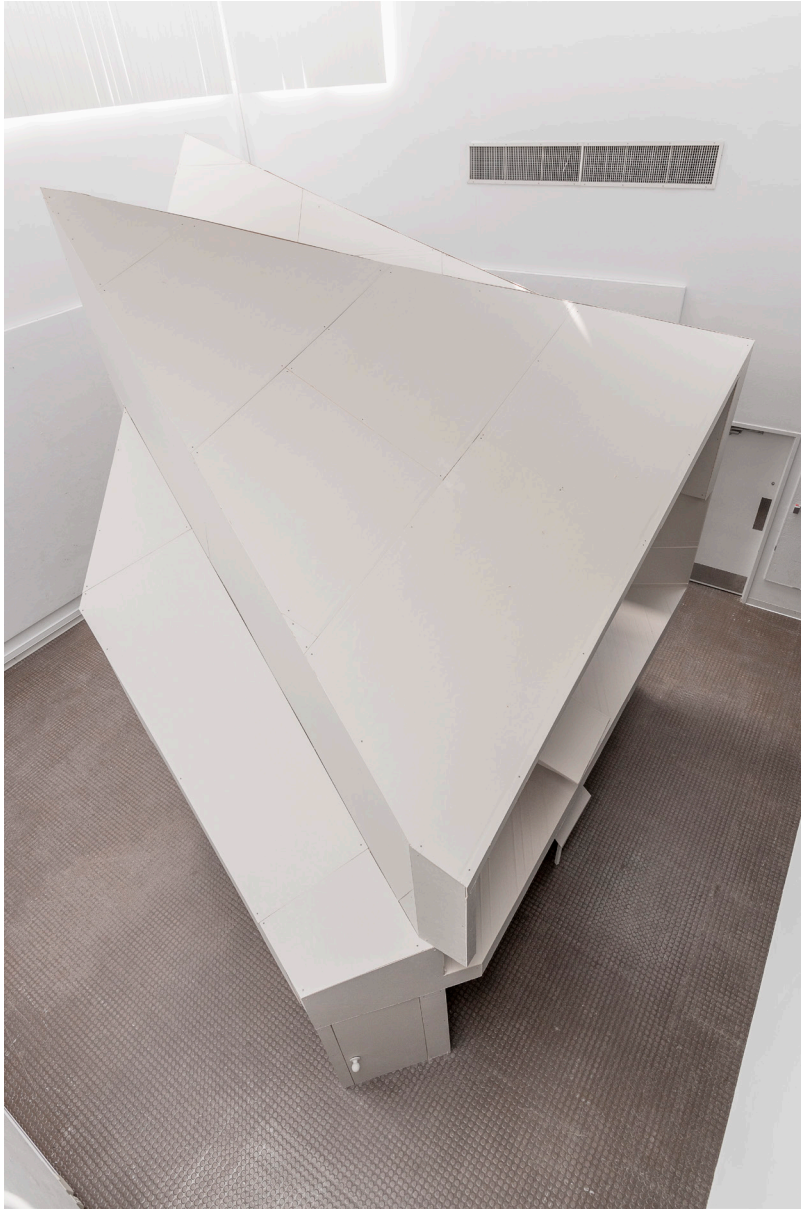
Michelle Chang, "A, B 1:2," wood and plasterboard, 16' x 16' x 16', 2017, Houston, TX; Commissioned by Rice Architecture, $5,000