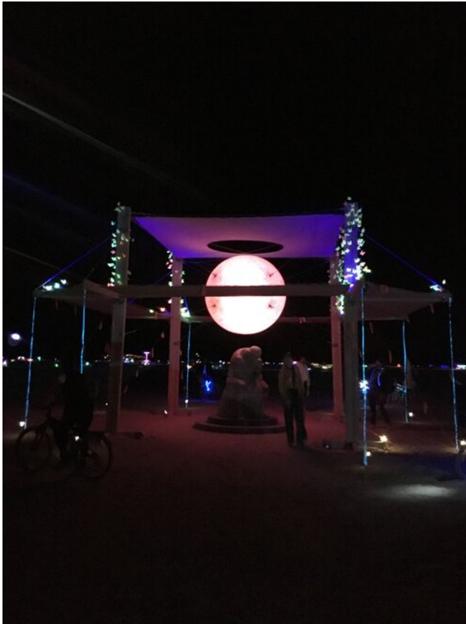
"Monument of Indecision" by Henry Washer. Created for Burning Man 2018. A night time photo showing the night time design.