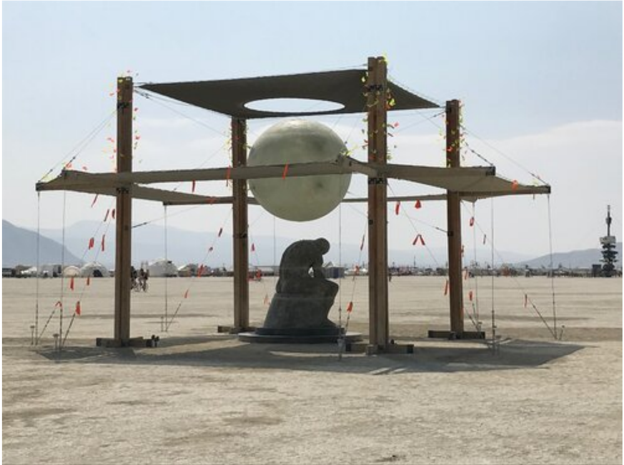
“Monument of Indecision”. Created for Burning Man 2018. Design and Built by Artist and small team of volunteers.