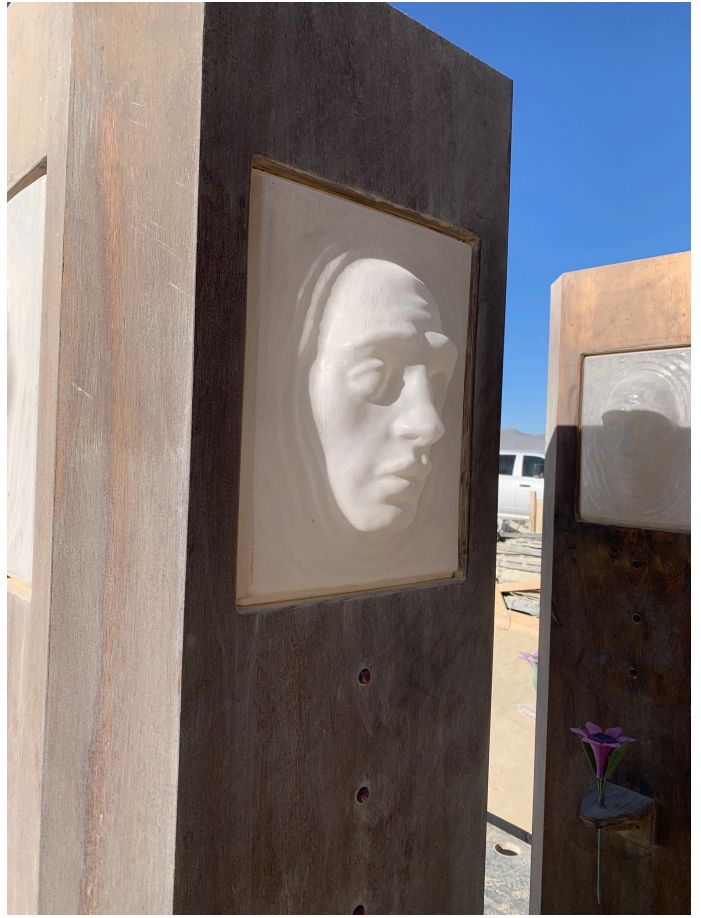
Sculpted and Vacuum formed faces for OpaLights Crew, Burning Man 2022. There were 16 of these surrounding the Man Base of the Burning Man.