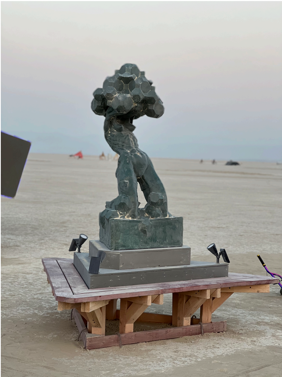
“Between the Cracks of Heaven’s Structure” 2023 for Burning Man by Henry Washer. A figurative sculpture to stand outside the “Complexahedron”.