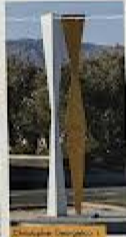
Christopher Cummings | Populartree