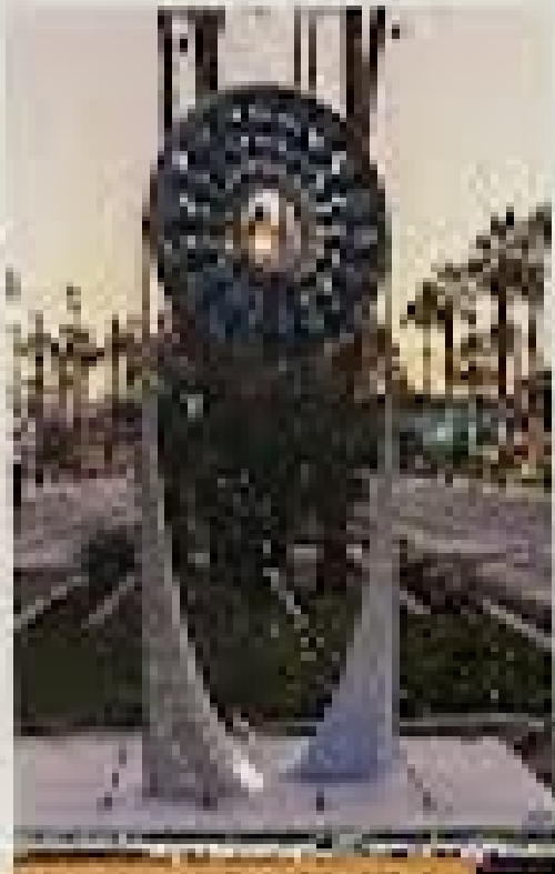
Michael Heizer | Eye of the Wind

18 sculptures from celebrated artists across the U.S. Come explore Palm Desert's shoppers' paradise, where creativity is built into the landscape. For information, contact publicart@cityofpalmdesert.org or call 760.776.6346.