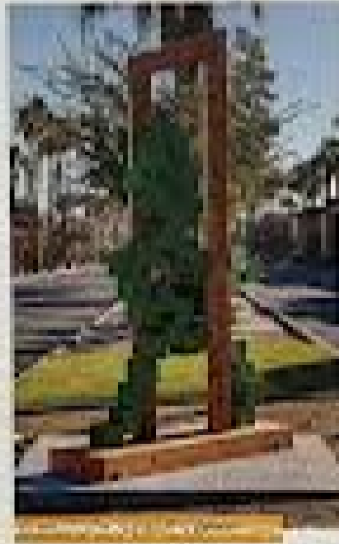
James Turrell | Palm Canyon