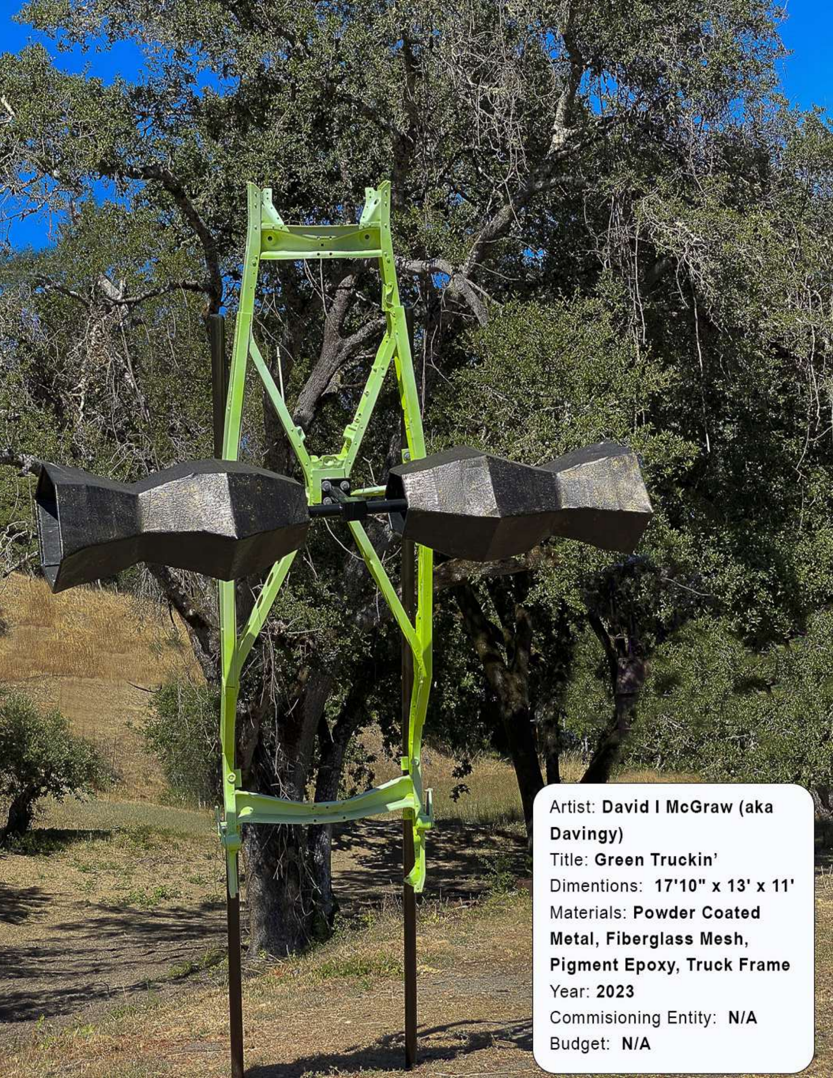
Artist: David I McGraw (aka Davingy) Title: Green Truckin' Dimensions: 17'10" x 13' x 11' Materials: Powder Coated Metal, Fiberglass Mesh, Pigment Epoxy, Truck Frame Year: 2023 Commissioning Entity: N/A Budget: N/A