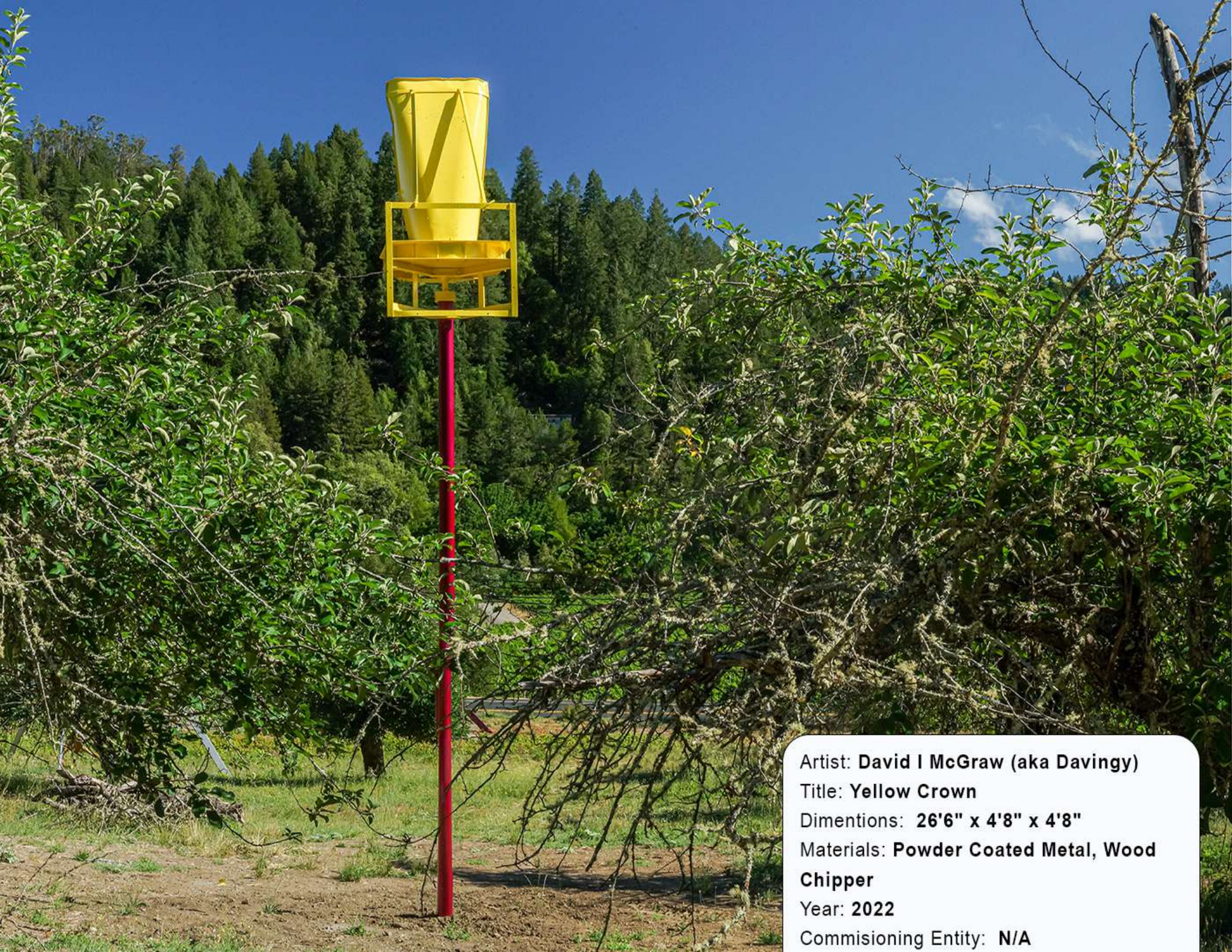
Artist: David I McGraw (aka Davingy) Title: Yellow Crown Dimensions: 26'6" x 4'8" x 4'8" Materials: Powder Coated Metal, Wood Chipper Year: 2022 Commissioning Entity: N/A