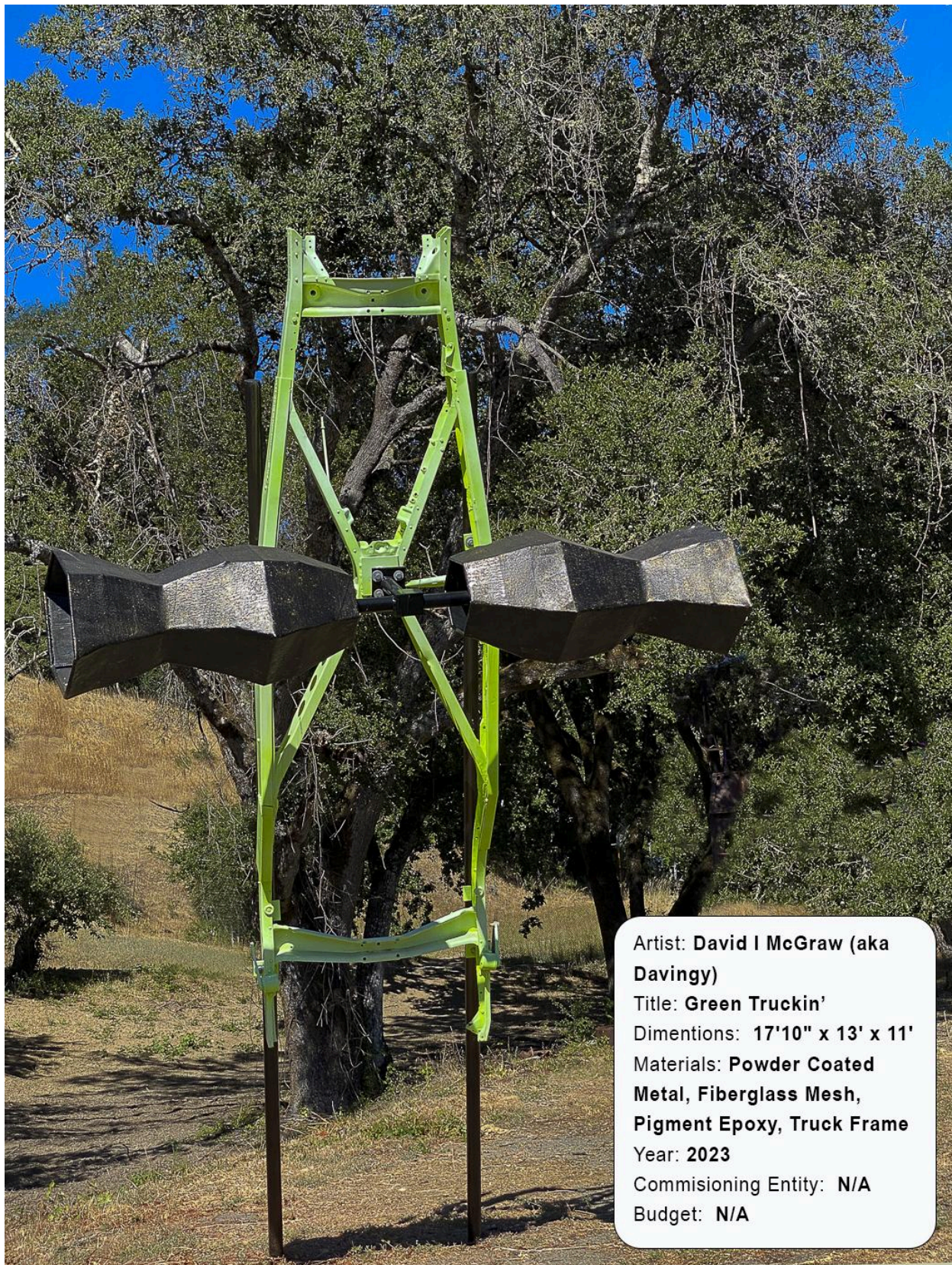
Artist: David I McGraw (aka Davingy) Title: Green Truckin' Dimensions: 17'10" x 13' x 11' Materials: Powder Coated Metal, Fiberglass Mesh, Pigment Epoxy, Truck Frame Year: 2023 Commissioning Entity: N/A Budget: N/A