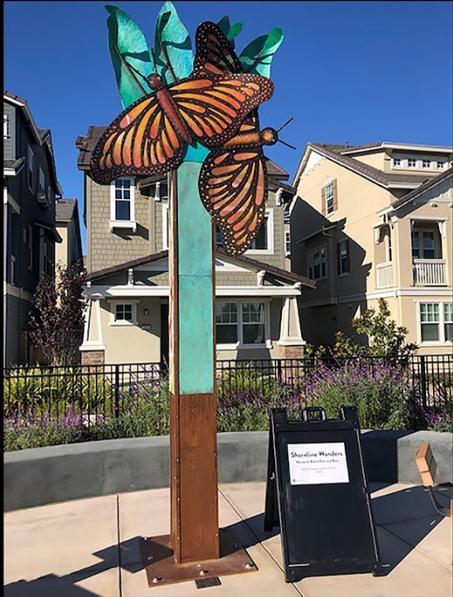
02-Shoreline Wanders - Pyramid Park - Mountain View, CA