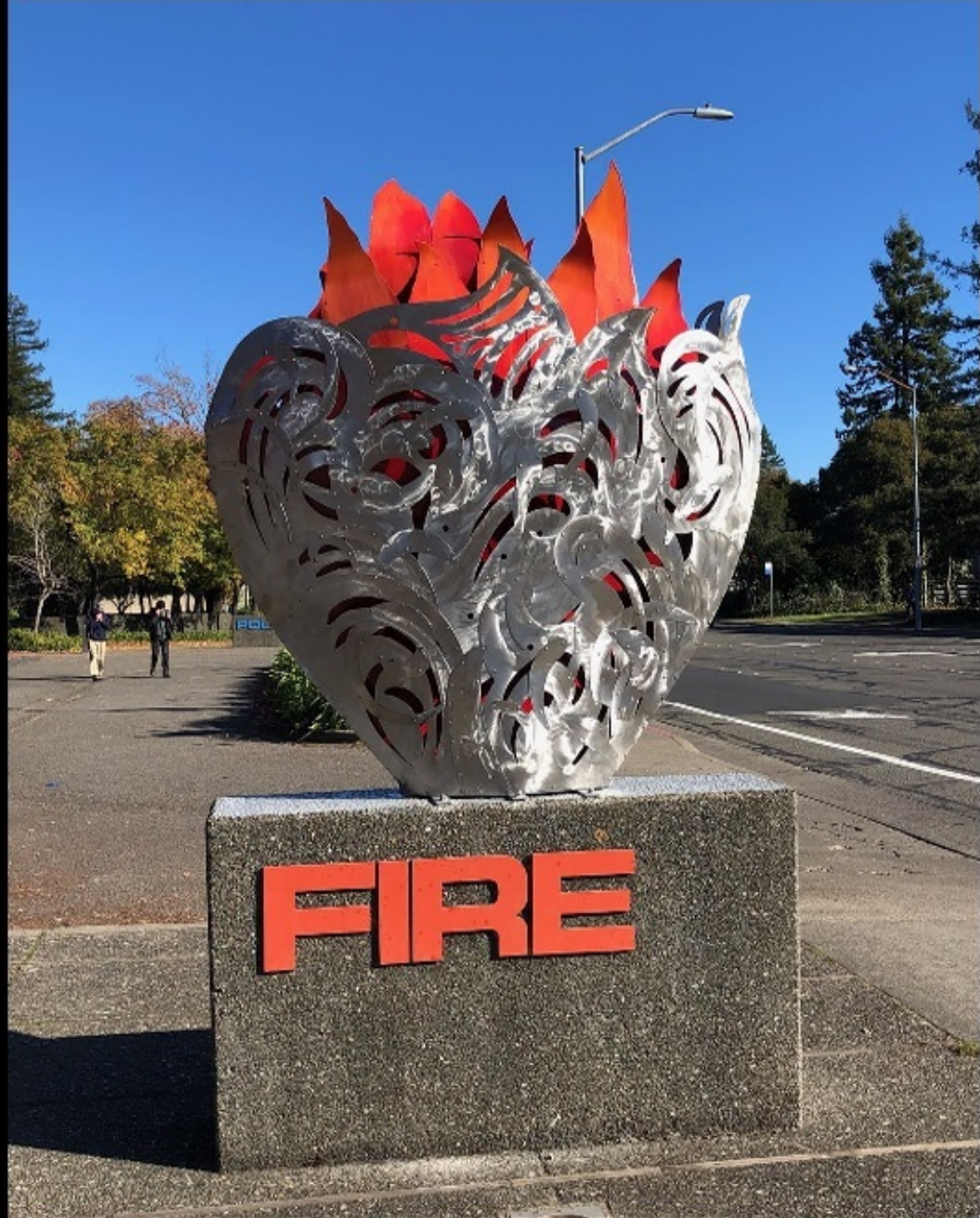
07 - Splash & Fire - Fire Station #1 - Santa Rosa, CA