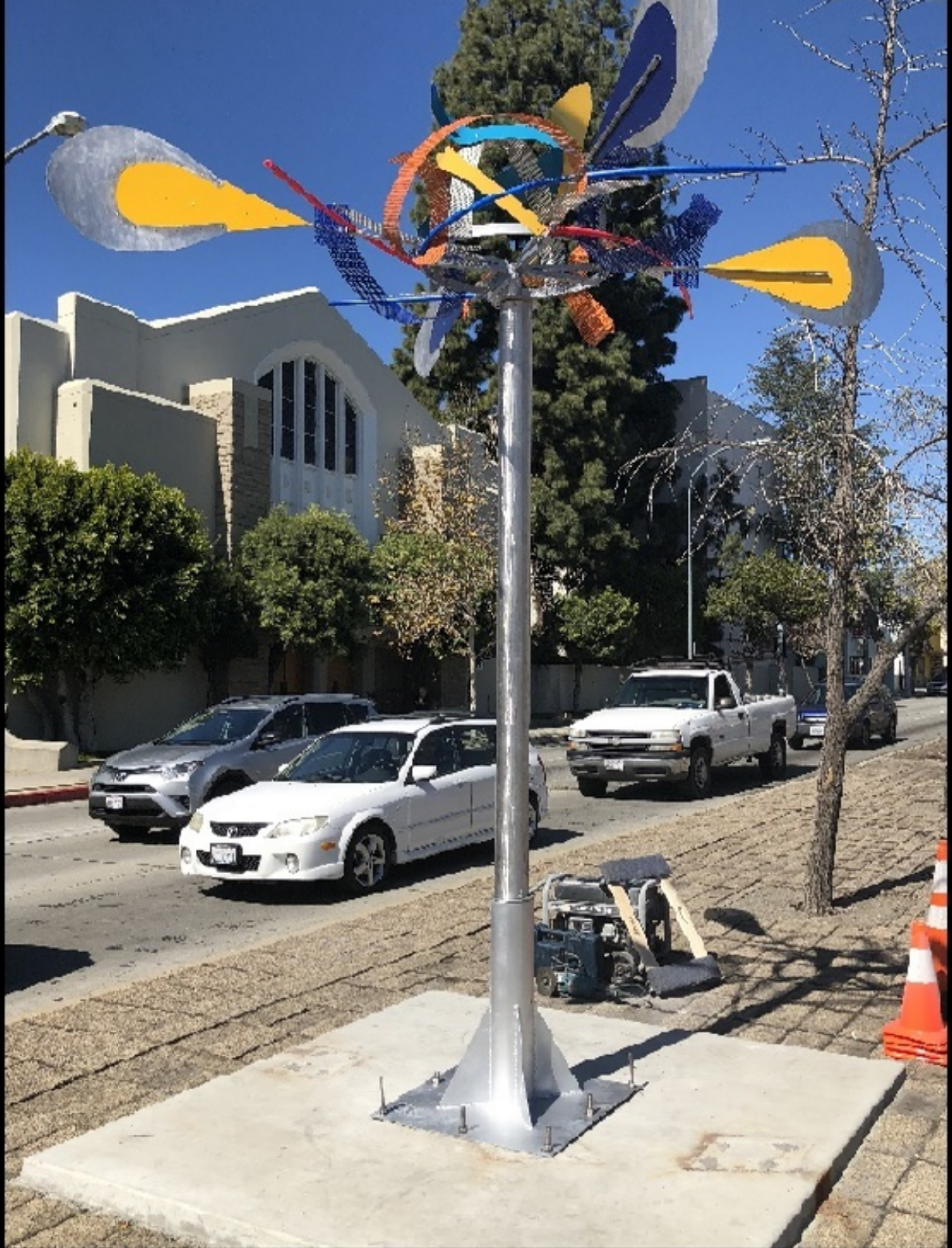
06 Galactic Cluster - Downtown Berkeley, CA