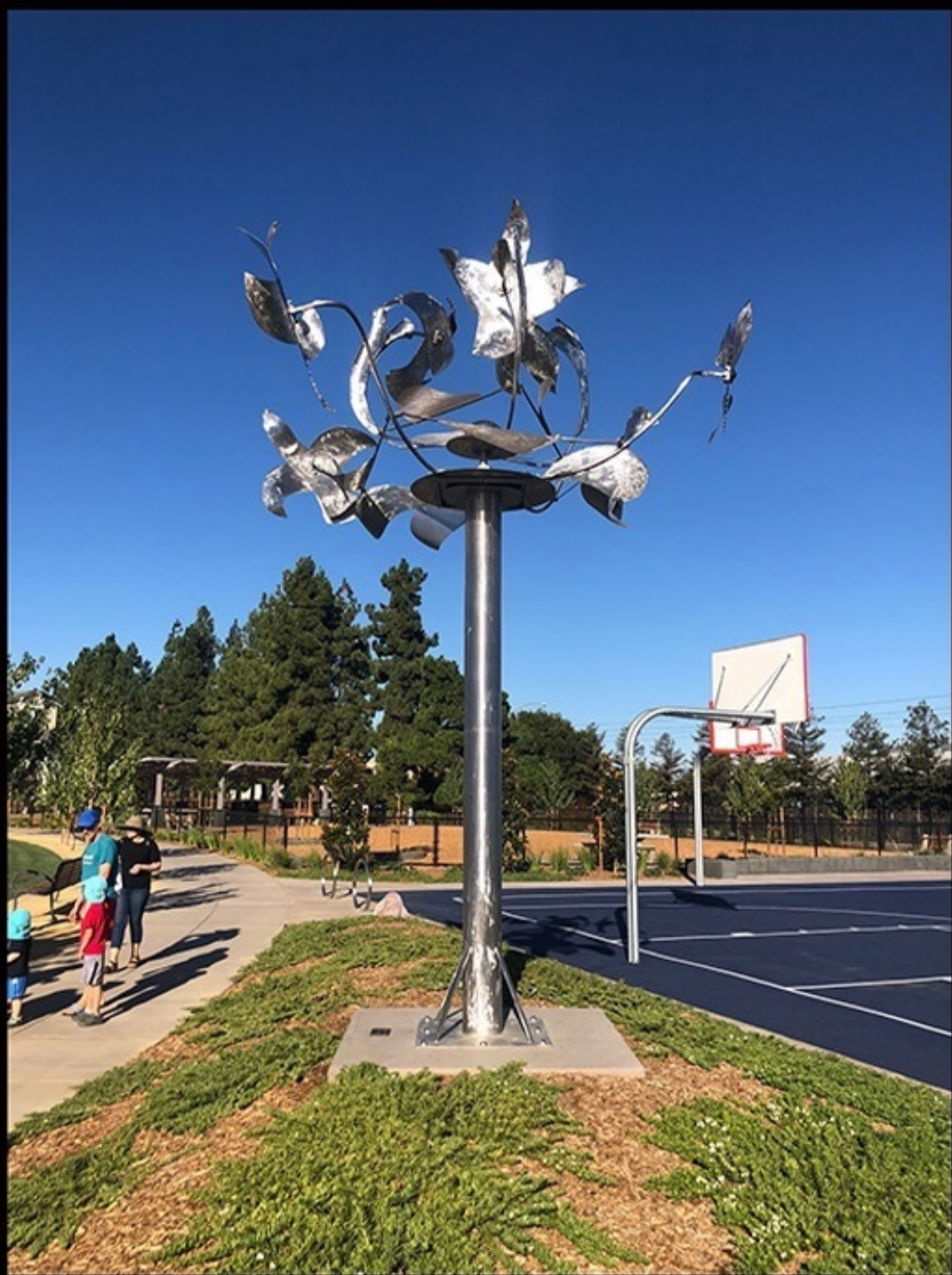
01-Magic Birds - Pyramid Park - Mountain View, CA