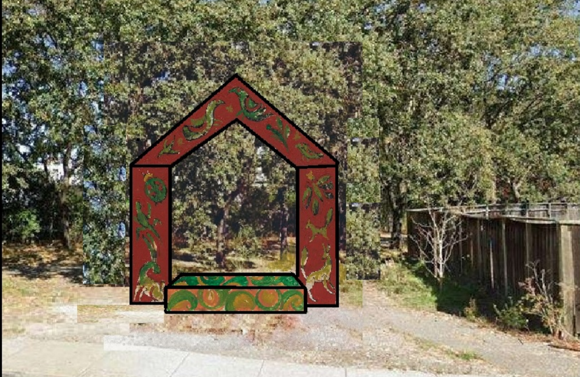
Magic Portal - Corten and Stainless steel sculpture with mosaic design bench.