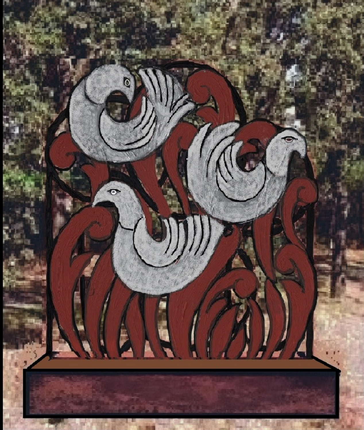
Dancing Birds - CorTen and Stainless steel sculpture with bench 9'H x 6'W x 2'D - Installation at the entrance of Joe Rodota Trail