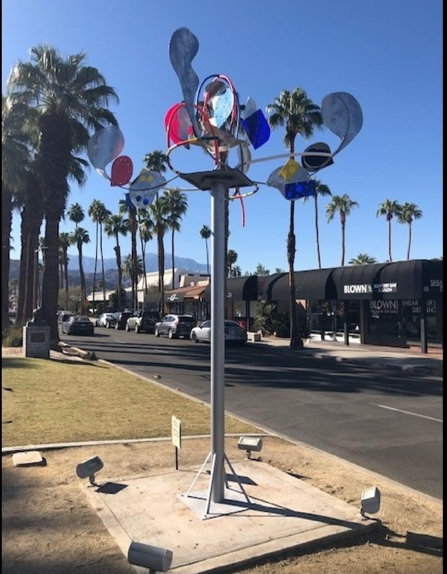
09 - Celestial Cluster - El Paseo - Palm Desert, CA