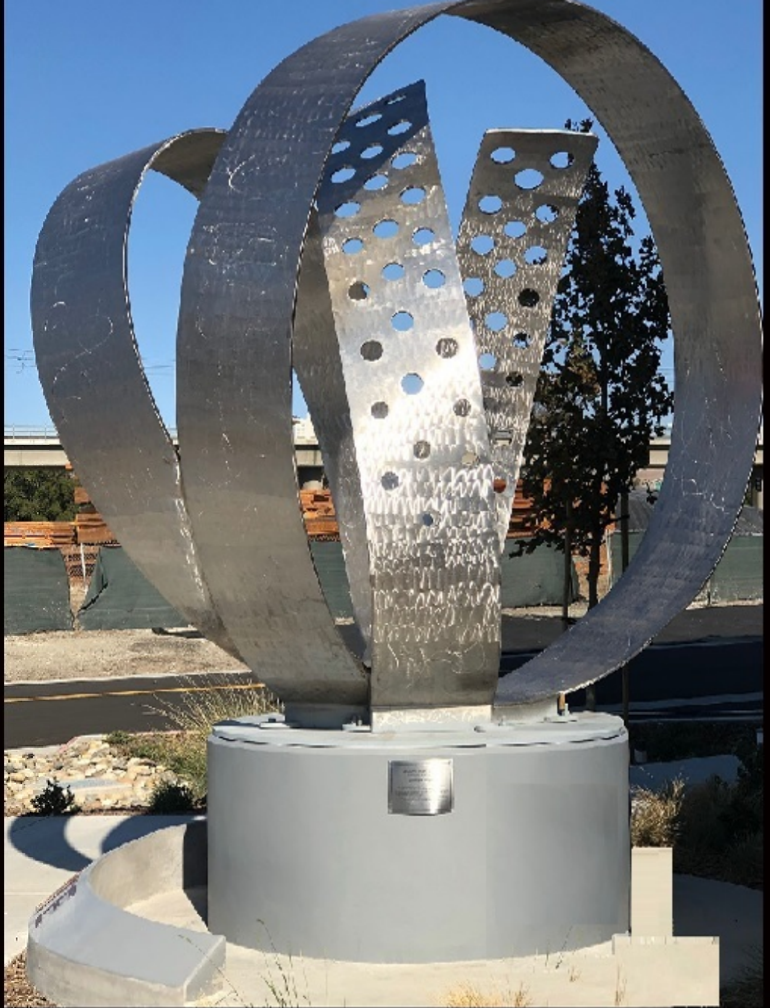
03 - Convergent Energies - Centre Pointe - Milpitas, CA