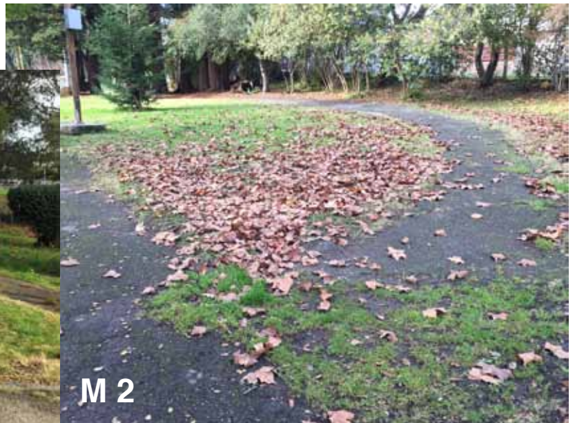
View from eastern side of onion patch