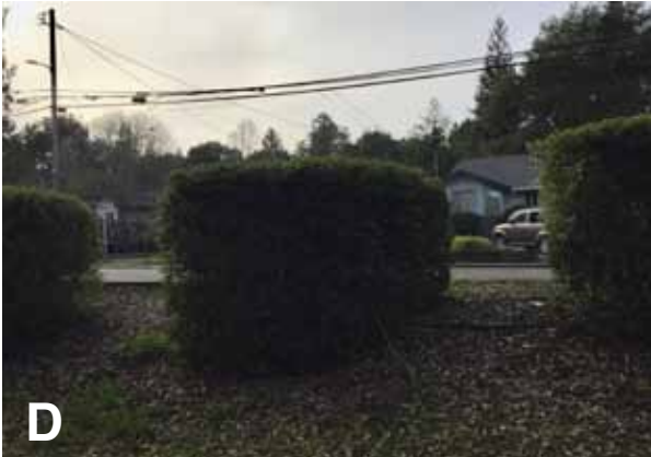
Gaps along Jewel Avenue