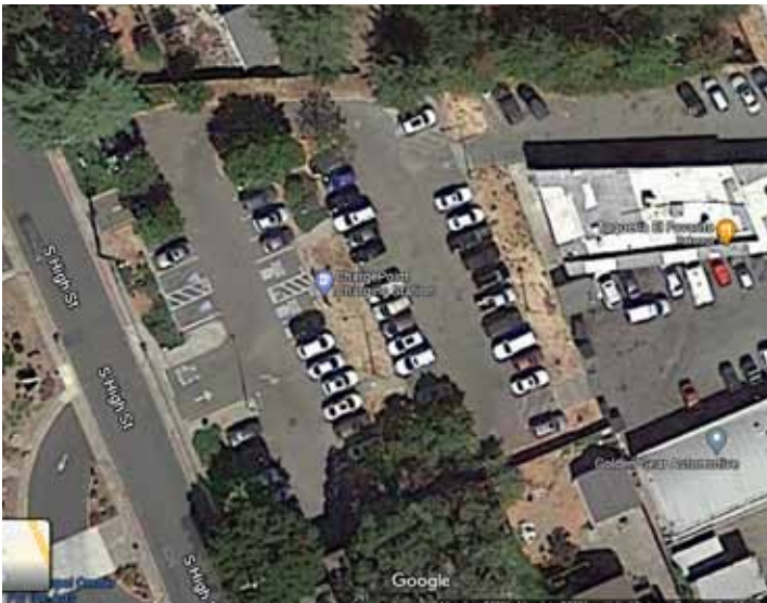
Above: Parking Log