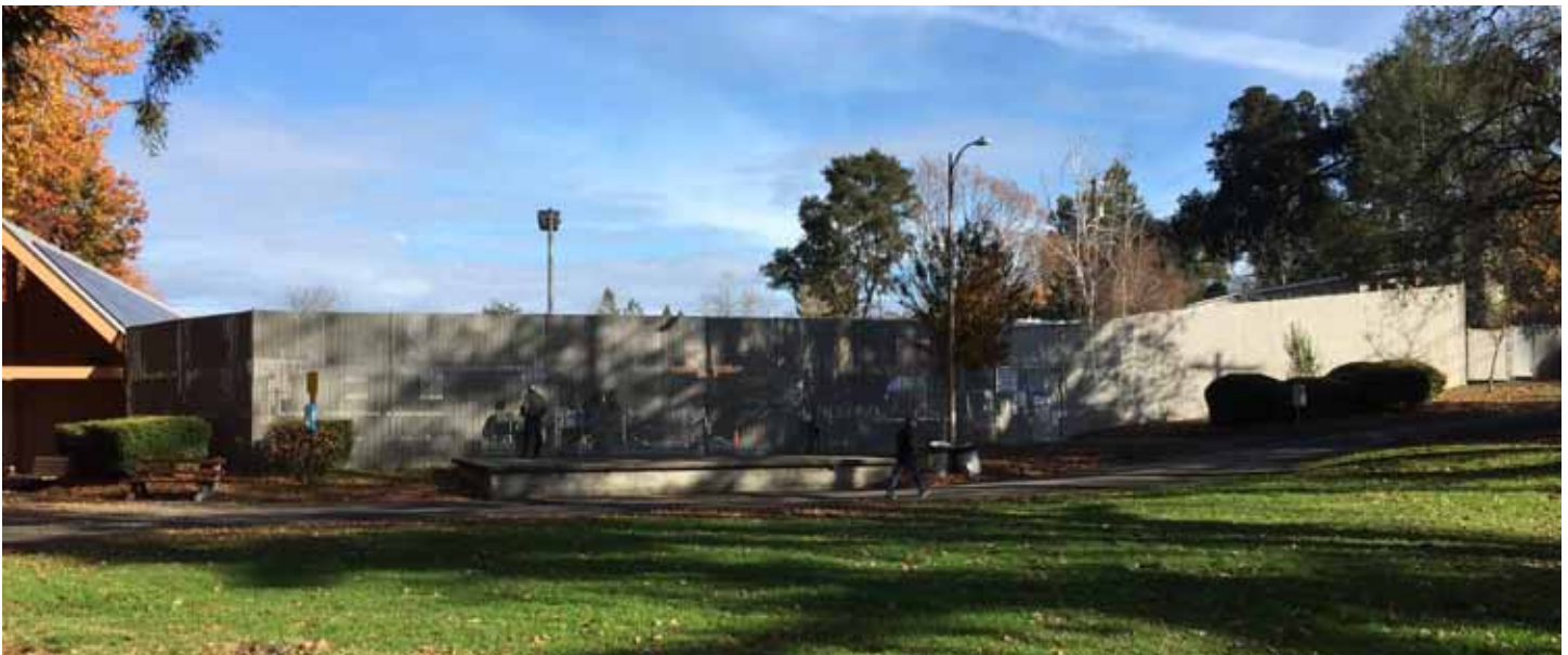
Ives Pool west fence, a potential site for a spray-paint mural