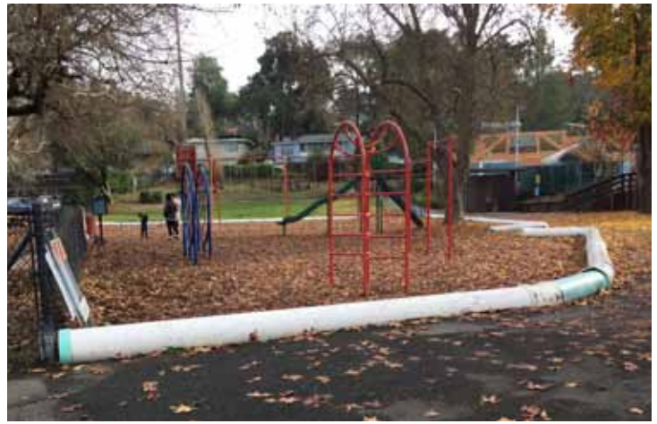
White PVC curb