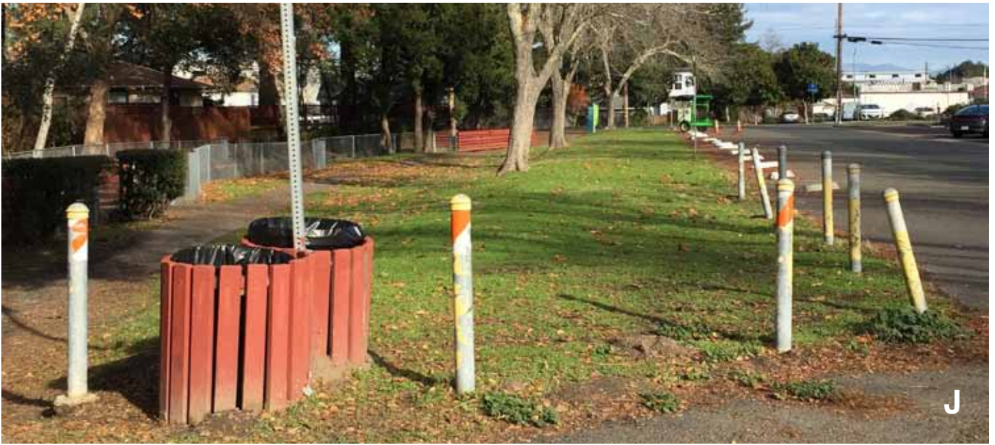
Both sides of the unreadable sign on the post above