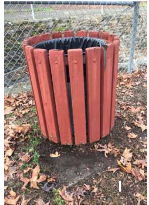
Note concrete pad under trash container