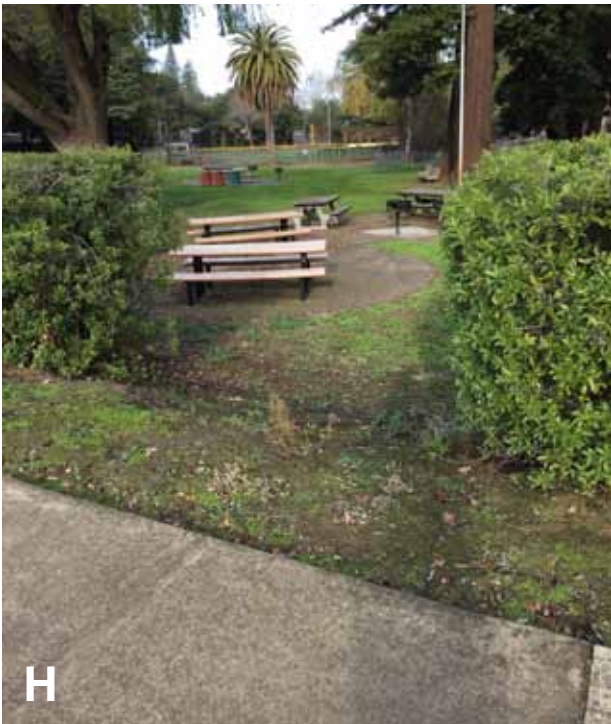
Above: Gaps at the corner Below: Gap at Willow