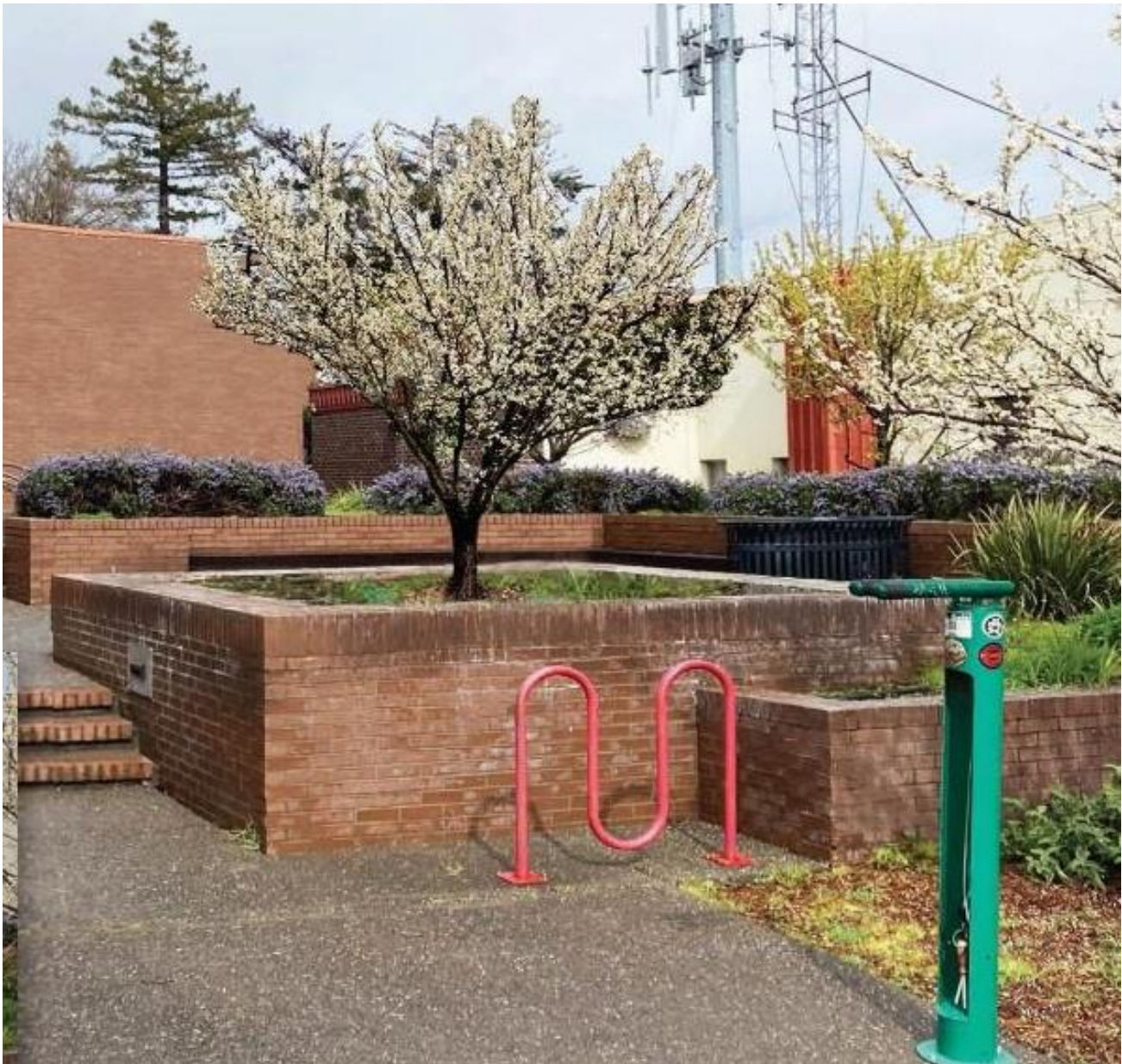
Proposed as Planter with Gravenstein Apple Tree