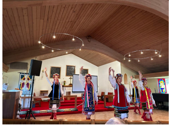
Zoloti Maky Ukrainian Dance Ensemble