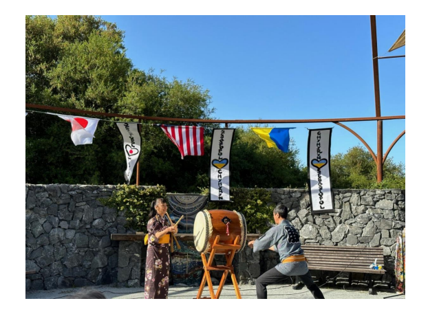
Tenten Taiko Local Japanese taiko drumming group

For more information about Sebastopol World Friends, visit<u>www.sebastopolwf.org</u>