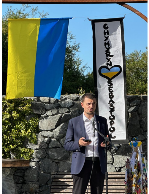
Dmytro Kushneruk Ukraine Consul General