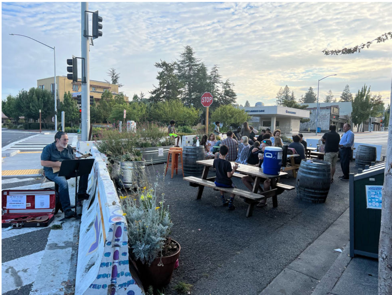
Sent from my iPhone

On Sep 19, 2022, at 6:19 AM, Maraline <screenmimis@comcast.net> wrote: