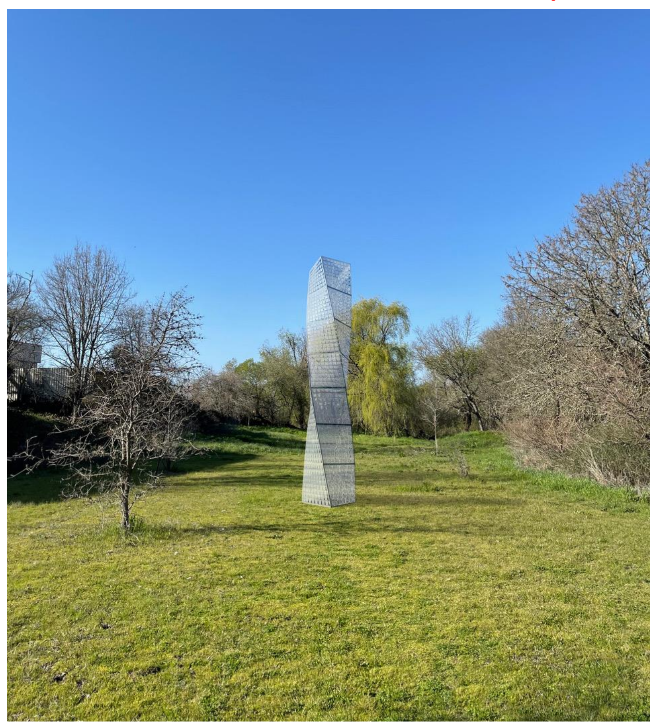
View of Sculpture looking north from Sebastopol Avenue (Trail will be along west side of meadow area)