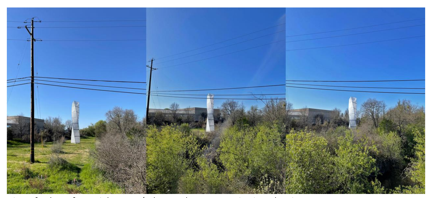
View of Column from Highway 12/Sebastopol Avenue coming into the City