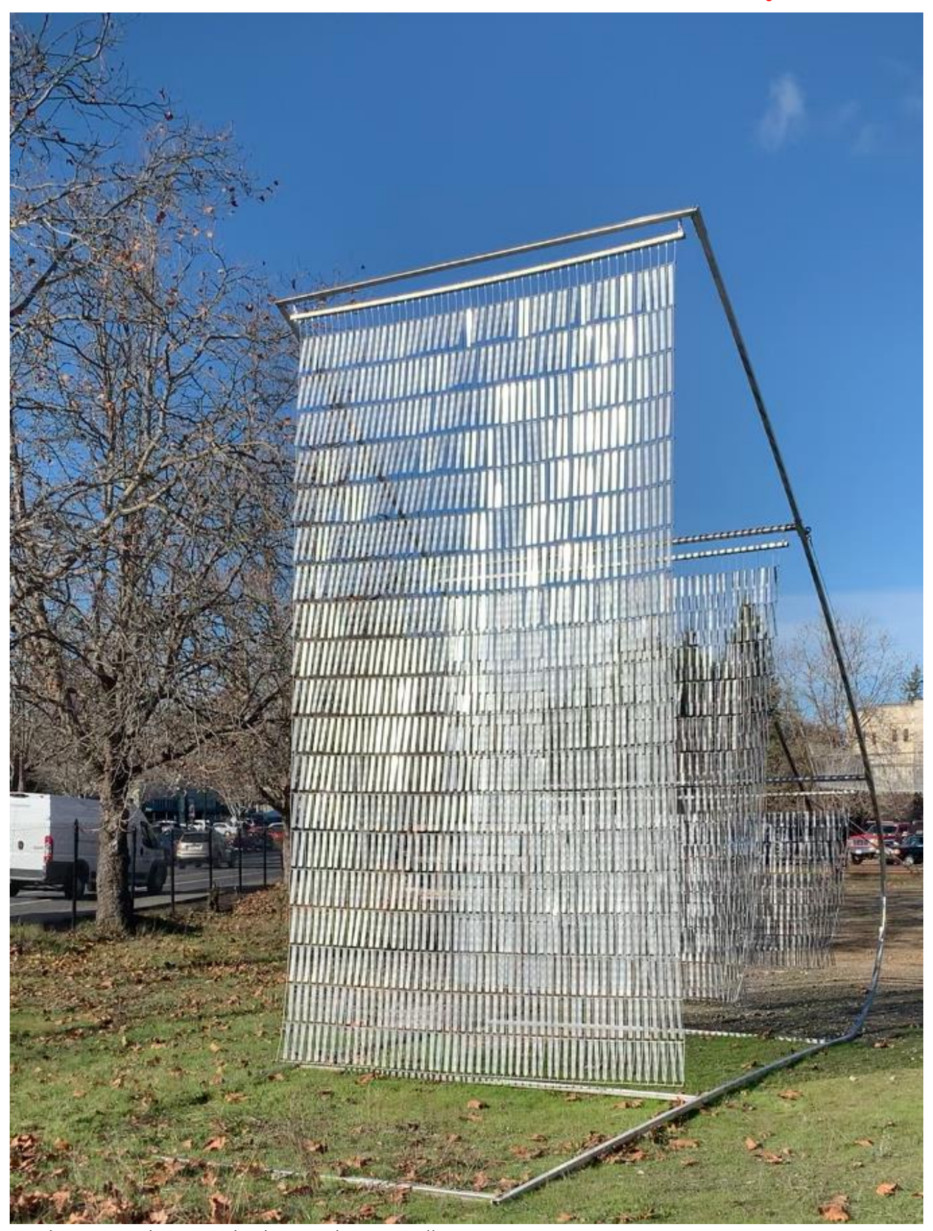
Similar Materials at Hotel Sebastopol Site installation