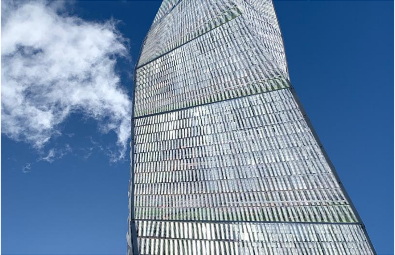
Detail of Column