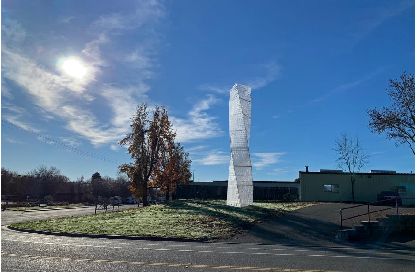
View of Column

The Artist will present the project, as well as a video, at the Council meeting, and both he and a PAC representative will be available to answer questions.