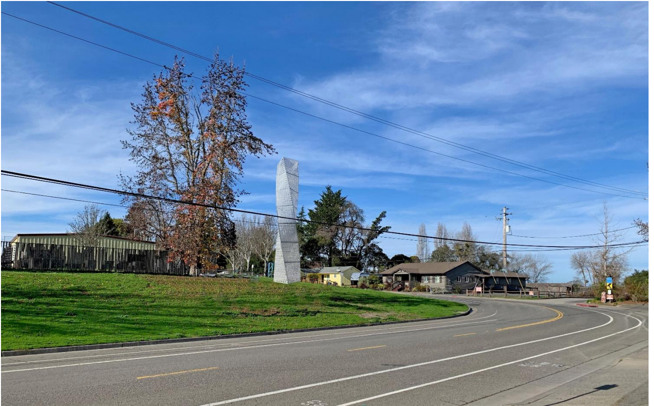
View from Morris Street/approach to Community Cultural Center