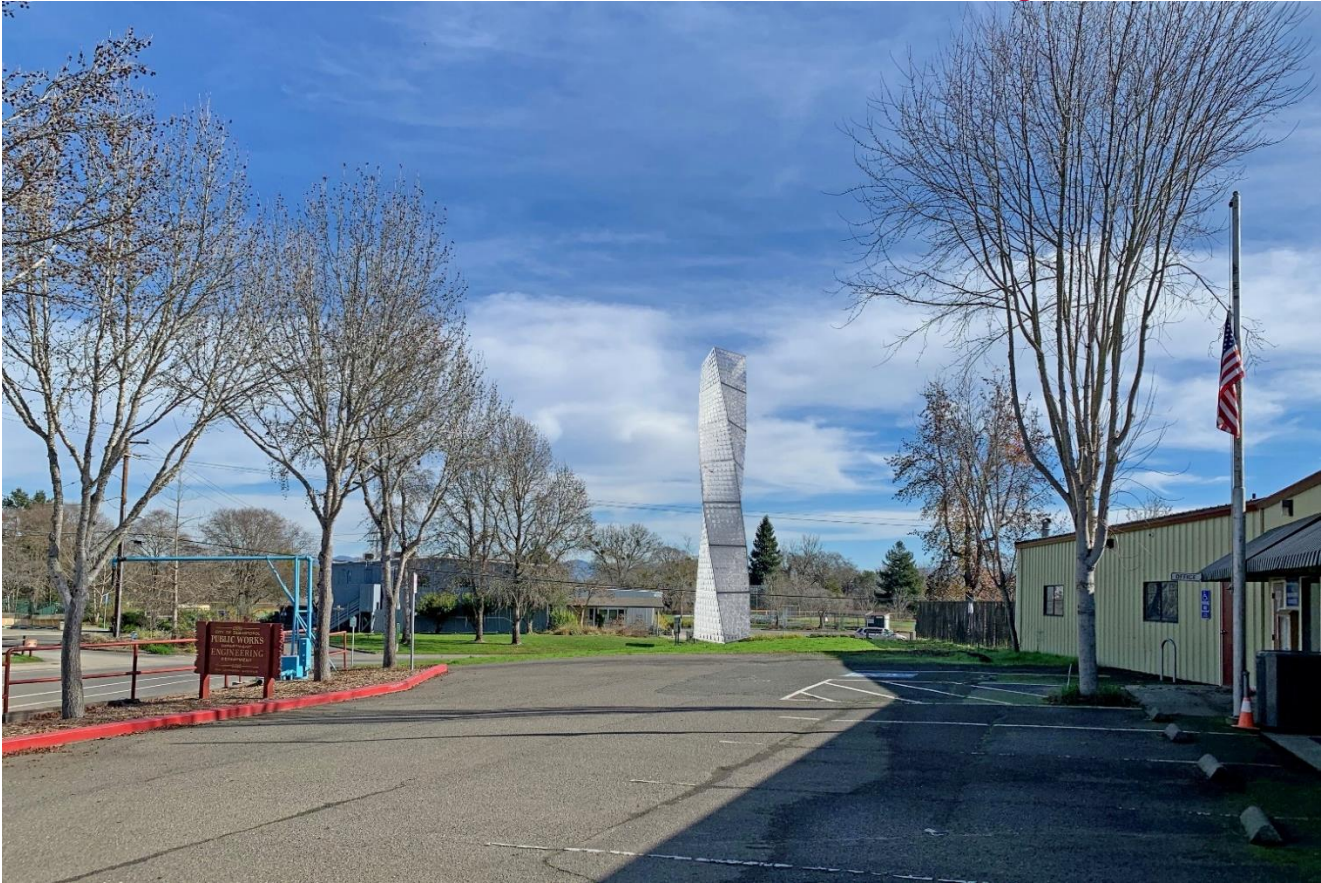
View from Johnson Street/West entry to Public Works building