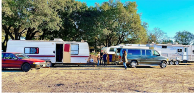
The First RV Dwellers arrive at Horizon Shine, the RV Village operated by Sonoma Applied Village Services

The new parking ordinance was expected to get its second reading at the February 1 City Council meeting. It's not on the agenda for February 1st any more. Why is that?