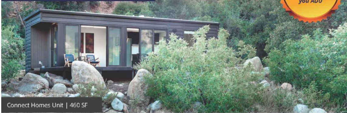
Connect Homes Unit | 460 SF