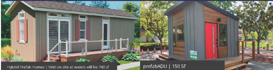
Hybrid Prefab Homes | Unit on-site at events will be 740 sf