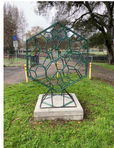
Medallion Artist: Briona Hendren

The Sebastopol City Council and its Public Arts Committee (PAC) invite Sonoma County-based artists to submit proposals for the new Community Sculpture Garden (CSG) located along the pedestrian walk between Ives Park's Calder Creek and the Sebastopol Center for the Arts. The CSG will eventually be comprised of eight sculptures. The first three sculptures were installed in January. Submission information may be found HERE .