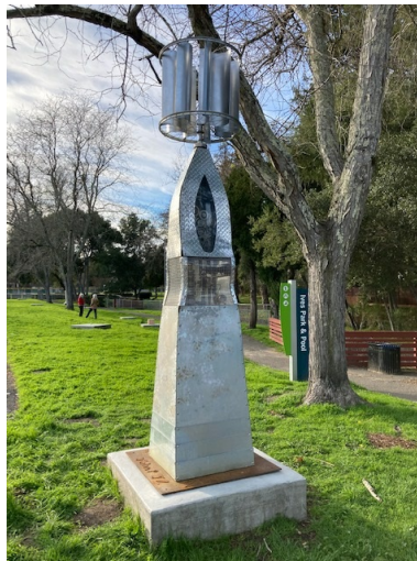
Zephyra Artist: Sculpture Jam