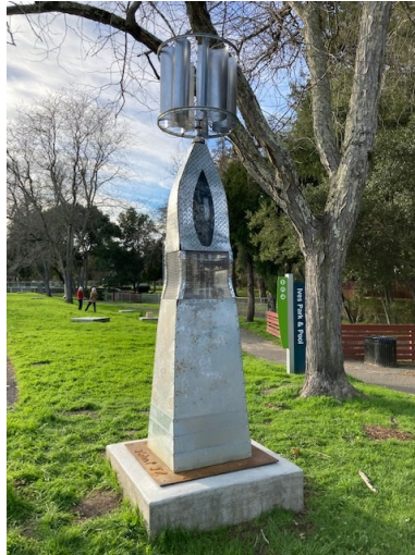
Zephyra Artist: Sculpture Jam