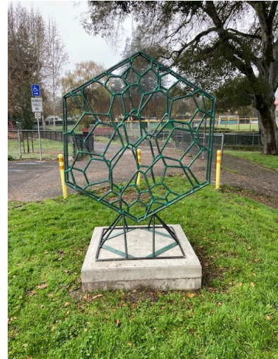
Medallion Artist: Briona Hendren

The Sebastopol City Council and its Public Arts Committee (PAC) invite Sonoma County-based artists to submit proposals for the new Community Sculpture Garden (CSG) located along the pedestrian walk between Ives Park's Calder Creek and the Sebastopol Center for the Arts. The CSG will eventually be comprised of eight sculptures. The first three sculptures were installed in January. Submission information may be found HERE .